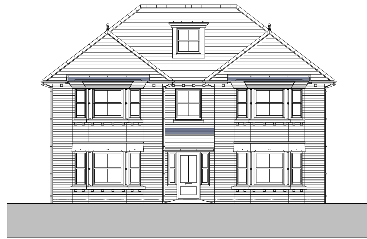
PROPOSED FRONT ELEVATION (NORTH-WEST)

Note Use figured dimensions only. All dimensions are in millimeters unless otherwise stated. All dimensions are to be checked on site prior to works commencing. Any discrepancies, errors or omissions shall be reported to Wakefield Poyser. All Contractors carrying out these works are deemed to be the Principle Contractor and must comply with all of the requirements of the Construction, Design & Management (CDM) Regulations 2015.