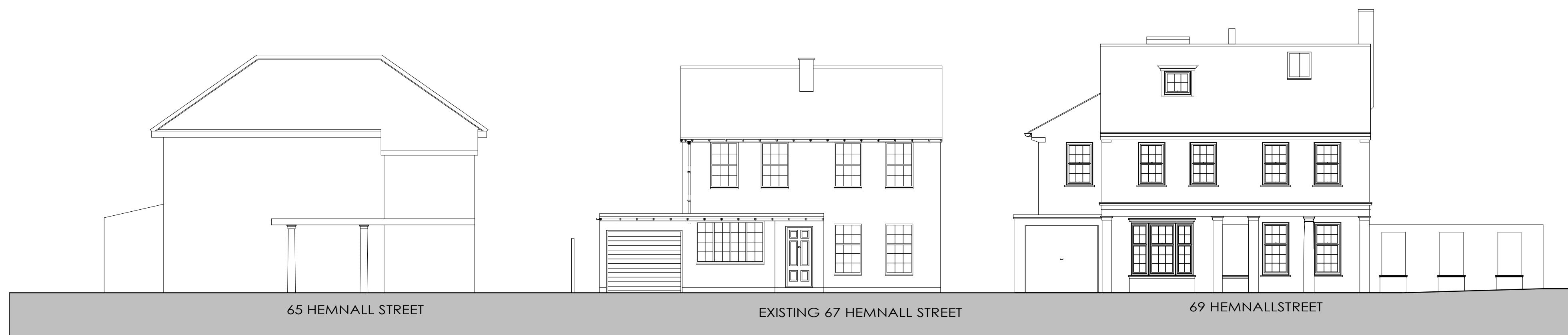
EXISTING STREET SCENE