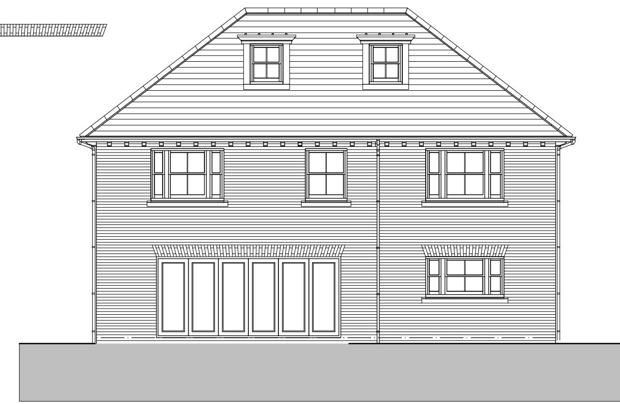
PROPOSED REAR ELEVATION (SOUTH-EAST)