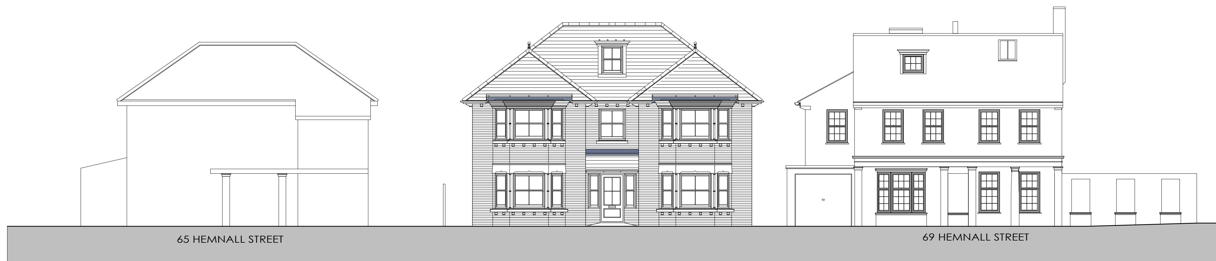
PROPOSED STREET SCENE